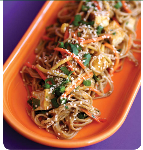
Teens want adventurous fare with a touch of home—noodles and peanut butter make this cold salad a cost-effective side.