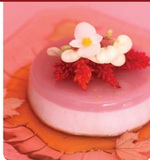
Light and silky, this panna cotta gets its soft pink color from dried hibiscus and lemon flavor from lemon zest.