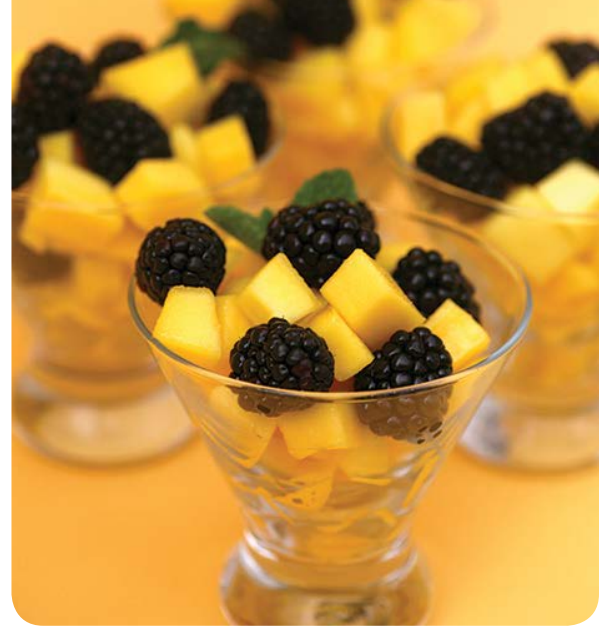
Simple, fruit-focused desserts work best for healthcare.