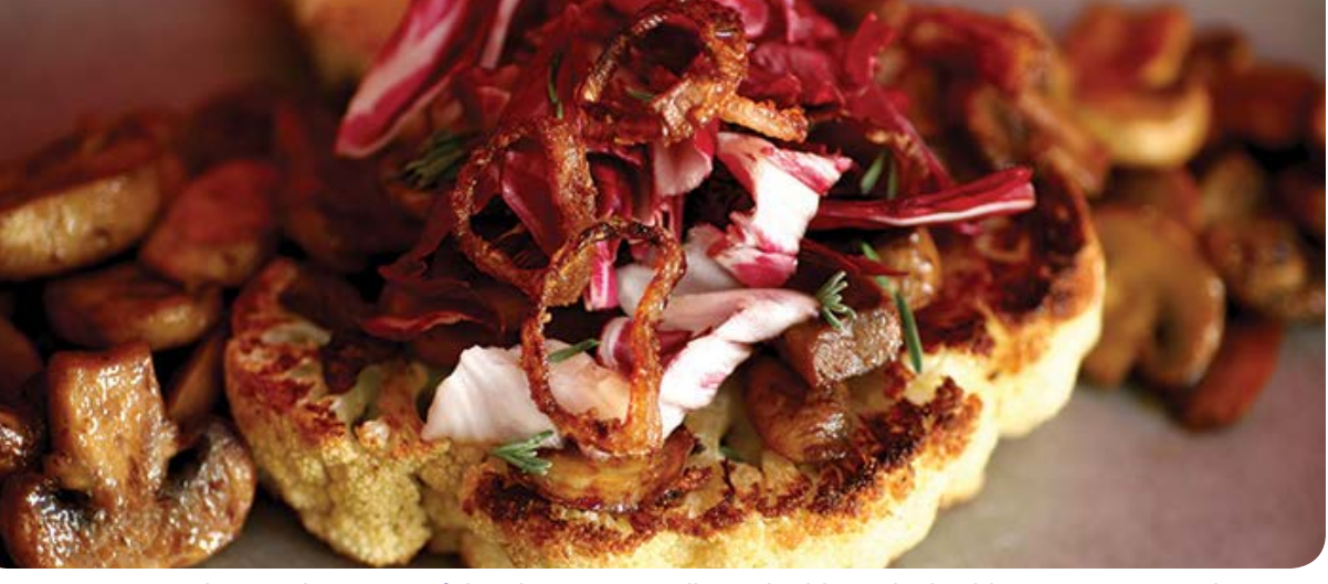
Serving produce as the center of the plate is especially applicable to the healthcare sector—try this satisfying cauliflower steak with hearty mushrooms and onions.