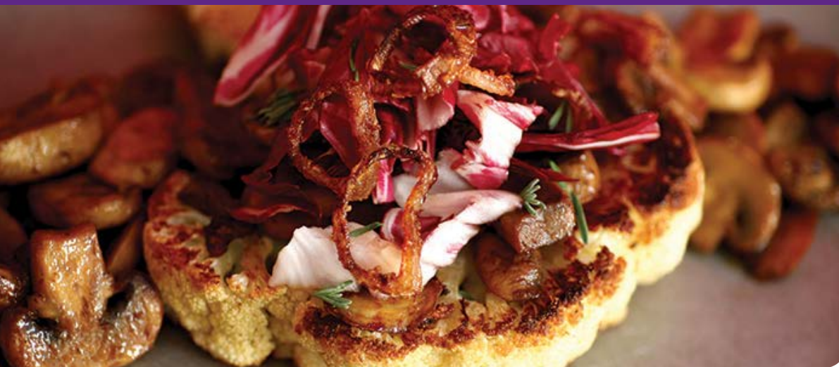
Serving produce as the center of the plate is especially applicable to the healthcare sector—try this satisfying cauliflower steak with hearty mushrooms and onions.