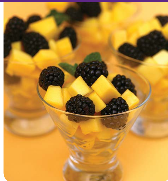
Simple, fruit-focused desserts work best for healthcare.