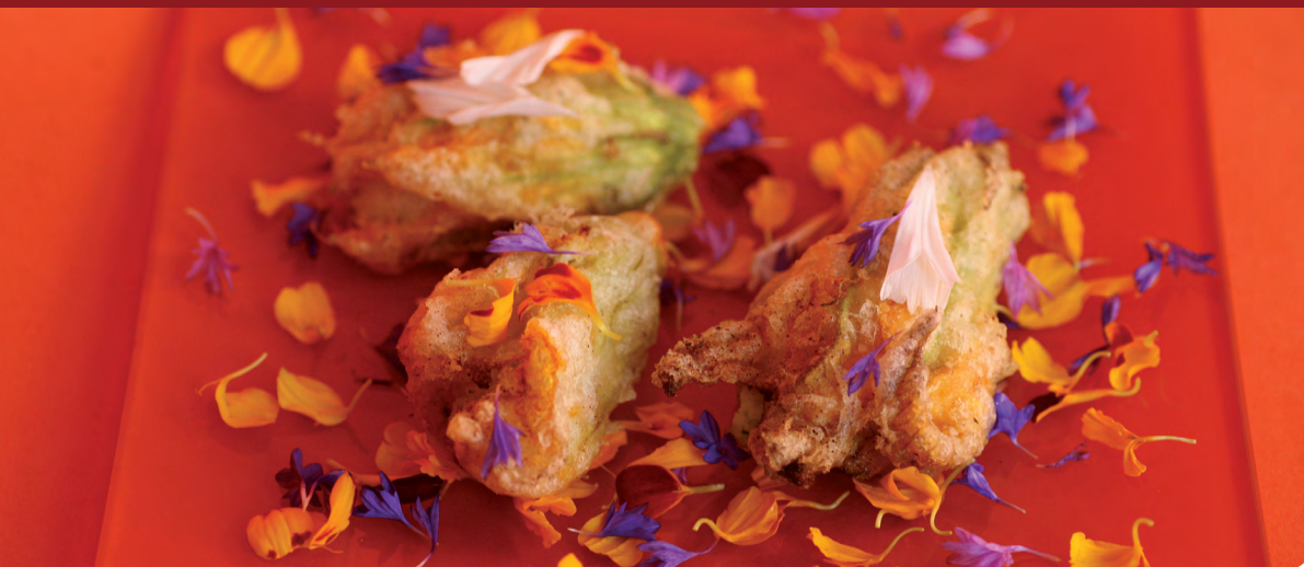
Classic, but reinvented with artisan cheese and hints of lemon, lightly fried zucchini blossoms make ideal appetizers.