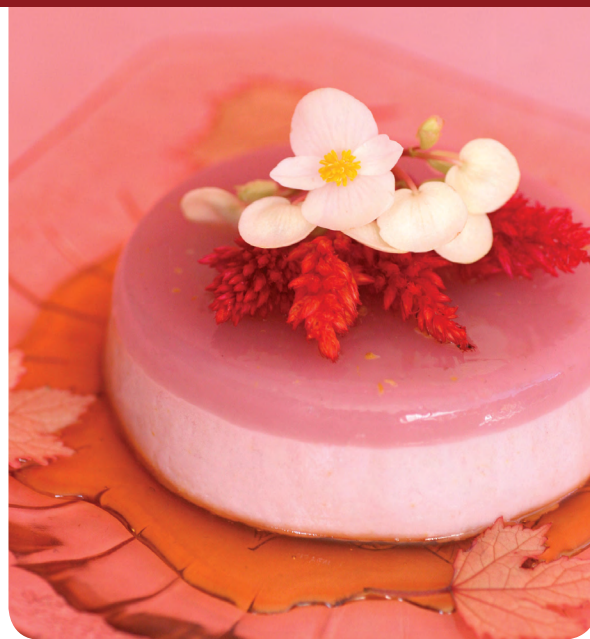
Light and silky, this panna cotta gets its soft pink color from dried hibiscus and lemon flavor from lemon zest.