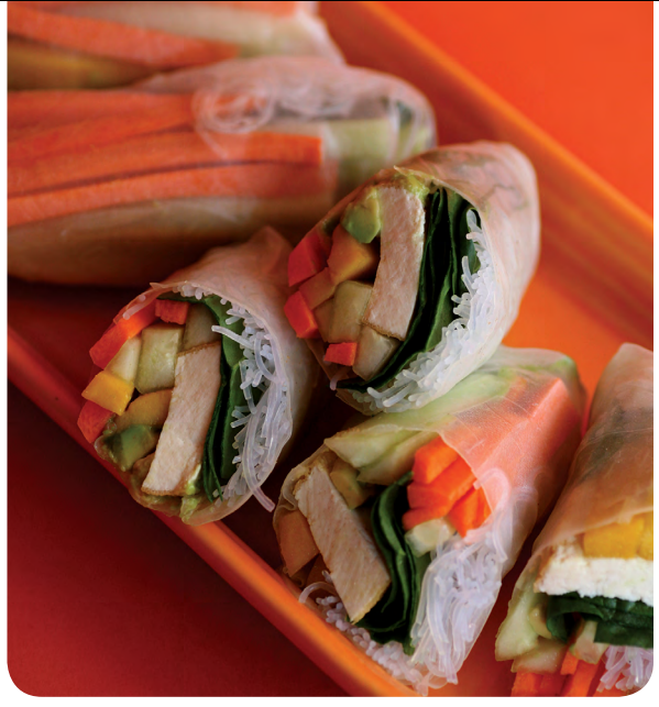
Vietnamese Fresh Rolls: Fill with a variety of fruits and vegetables, noodles, and proteins like shrimp or tofu