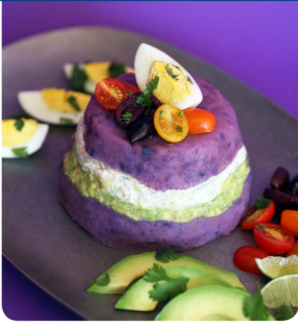
The name may sound exotic, but this traditional Peruvian causa is comfort food made with potatoes