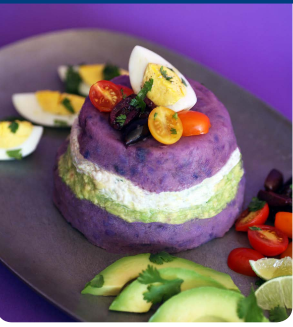
The name may sound exotic, but this traditional Peruvian causa is comfort food made with potatoes