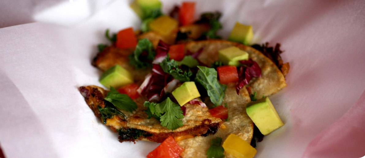
Give nutty, salty cheese quesadillas balance with the bitter notes of kale and radicchio.