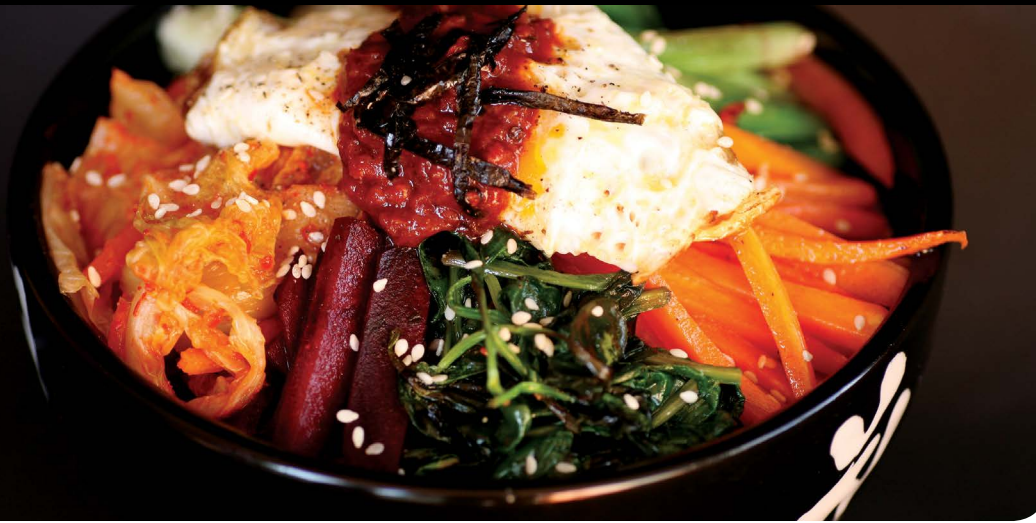
Korean Bibimbap is a versatile rice bowl dish—a favorite comfort food that combines rice, pickled and stir-fried vegetables, and topped with meat or a fried egg.