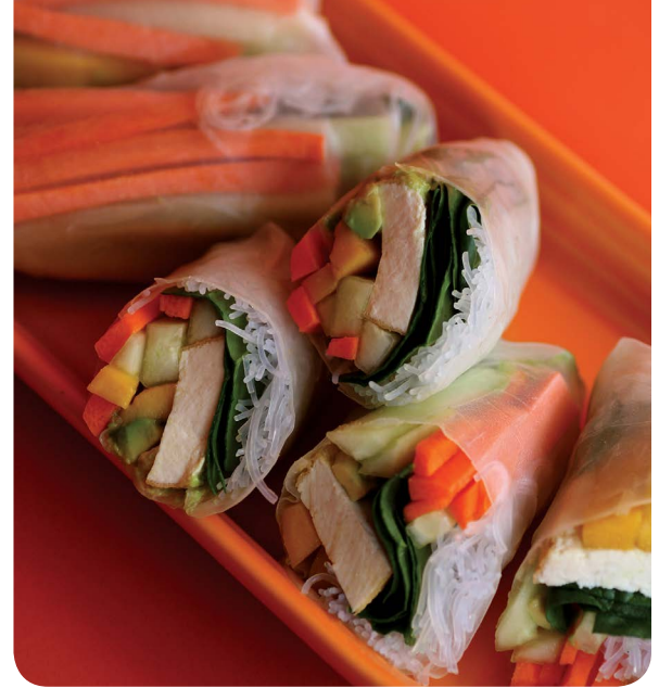
Vietnamese Fresh Rolls: Fill with a variety of fruits and vegetables, noodles, and proteins like shrimp or tofu