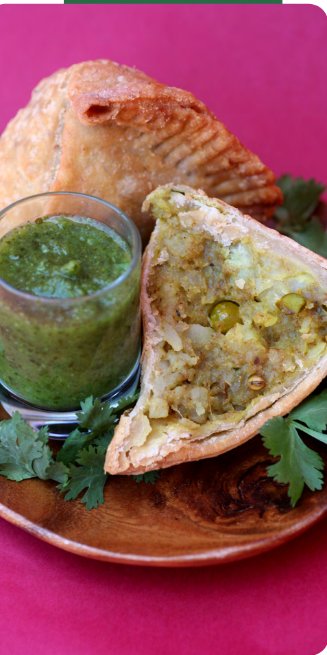
Indian Potato-Pea Samosas

Our value brand, Markon Essentials, includes the integral ingredients your kitchen can't do without. The main focus is value—yet we pack quality, food safety, sustainability, and consistency in every box.